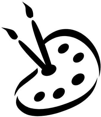
Community Painting/Mural Projects