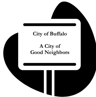
Community Signage Projects